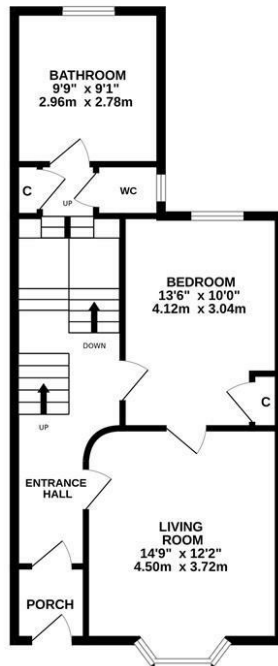
GROUND FLOOR 571 sq.ft. (53.0 sq.m.) approx.